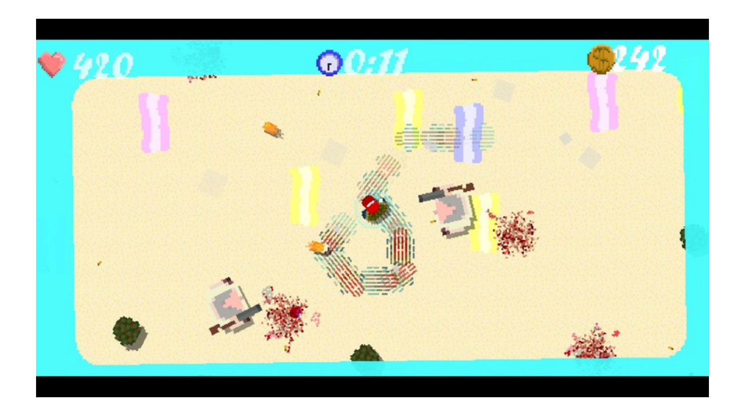
The Pirates Of Sector 7 Keygen Download Pc